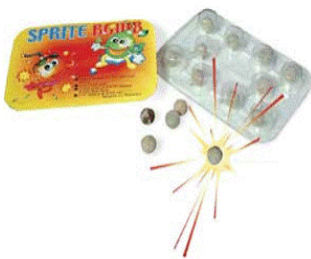
Sprite Bombs are small explosive devices packaged in containers that resemble children's candy.