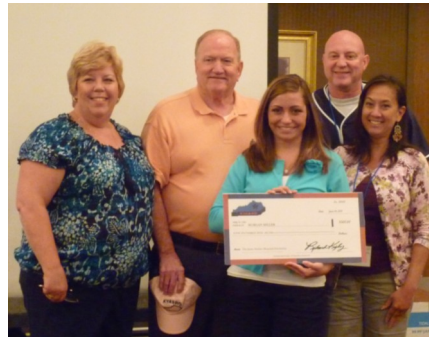
KYASRO board members awarding the 2010 James Sticklen Memorial Scholarship